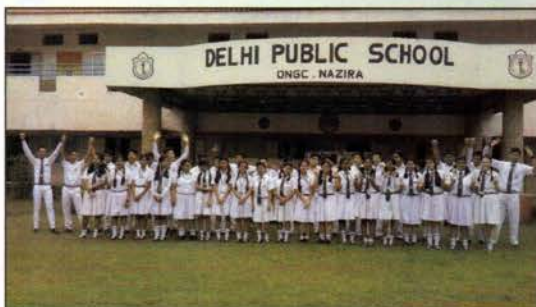
Students securing CGPA 10 in AISSE, 2017

"A dream you dream alone is only a dream. A dream you dream together is reality."